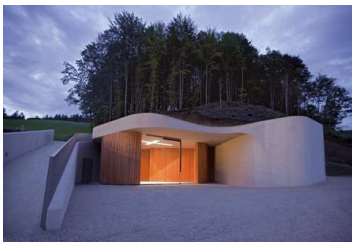
OFIS arhitekti, Farewell Chapel, 2005-2009 Krasnja, Slovenia